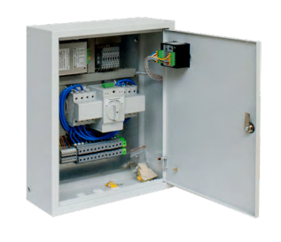
Programmable Logic Controllers, Intrinsic Safety Barriers